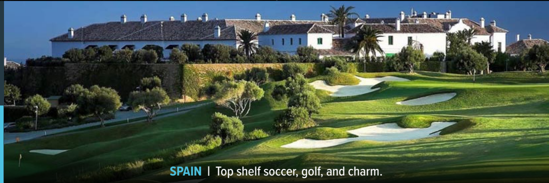
SPAIN | Top shelf soccer, golf, and charm.

Inquiries: jeff@grittygolfguide.com www.grittygolfguide.com