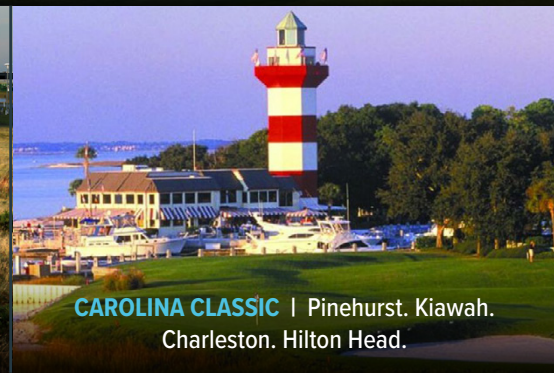
CAROLINA CLASSIC | Pinehurst. Kiawah. Charleston. Hilton Head.