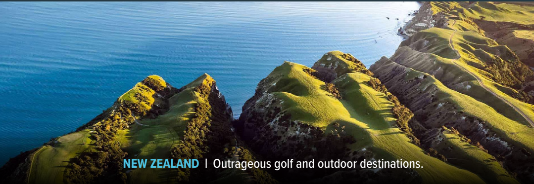
NEW ZEALAND | Outrageous golf and outdoor destinations.