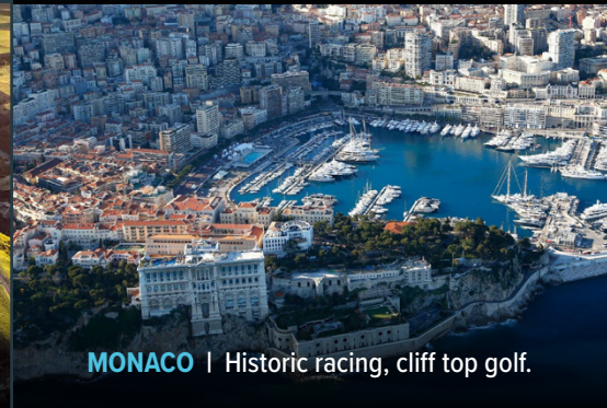
MONACO | Historic racing, cliff top golf.

Our premier, customizable packages include playing rounds, private group entertainment, happy hour course tours, etc.