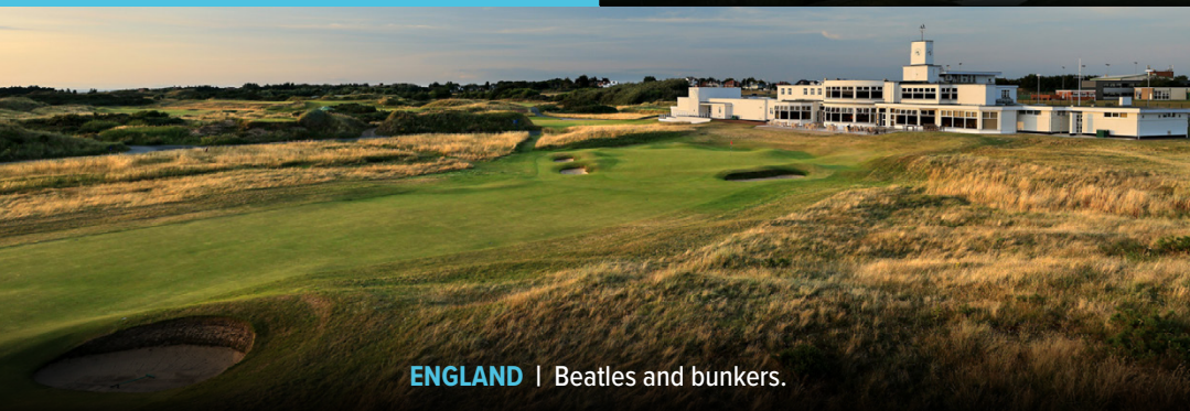
ENGLAND | Beatles and bunkers.