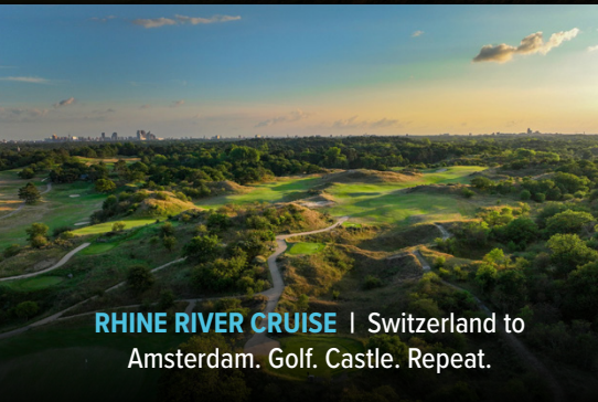
RHINE RIVER CRUISE | Switzerland to Amsterdam. Golf. Castle. Repeat.